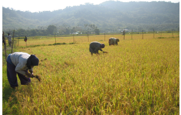
Women from Desa Rabo, Pulo Aceh, are harvesting their paddy